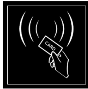
ID EM Cards

Support external emergency battery input