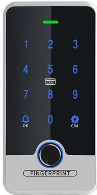
Light on state