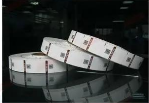
Packed By Roll