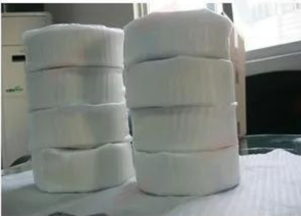
Protect with Bubble Pack