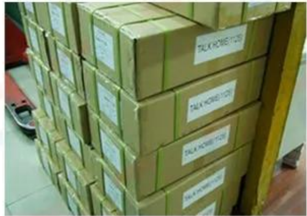
Outside Carton Package