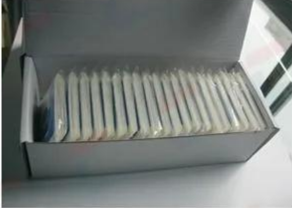
Packed By Pieces with OPP Bags