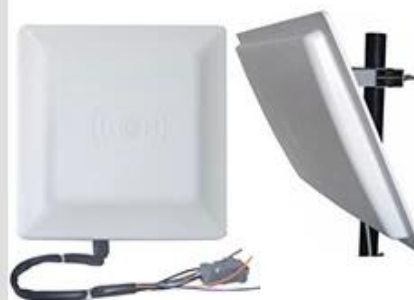
Long Distance UHF Reader