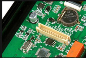
Import ARM32-bit CPU system