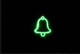
Backlit doorbell button