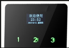
OLED LCD screen