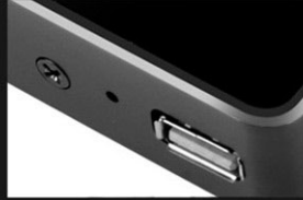
U disk transfer information