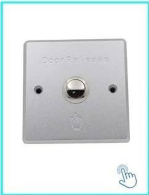
Door Release Button , (Stainless Steel, NO/NC)K5B: 86*86mm