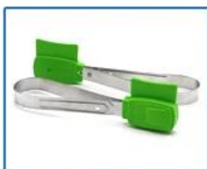
Metal Strap Seal