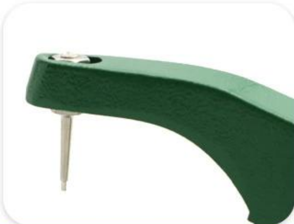
Selected metal materials, rust resistant