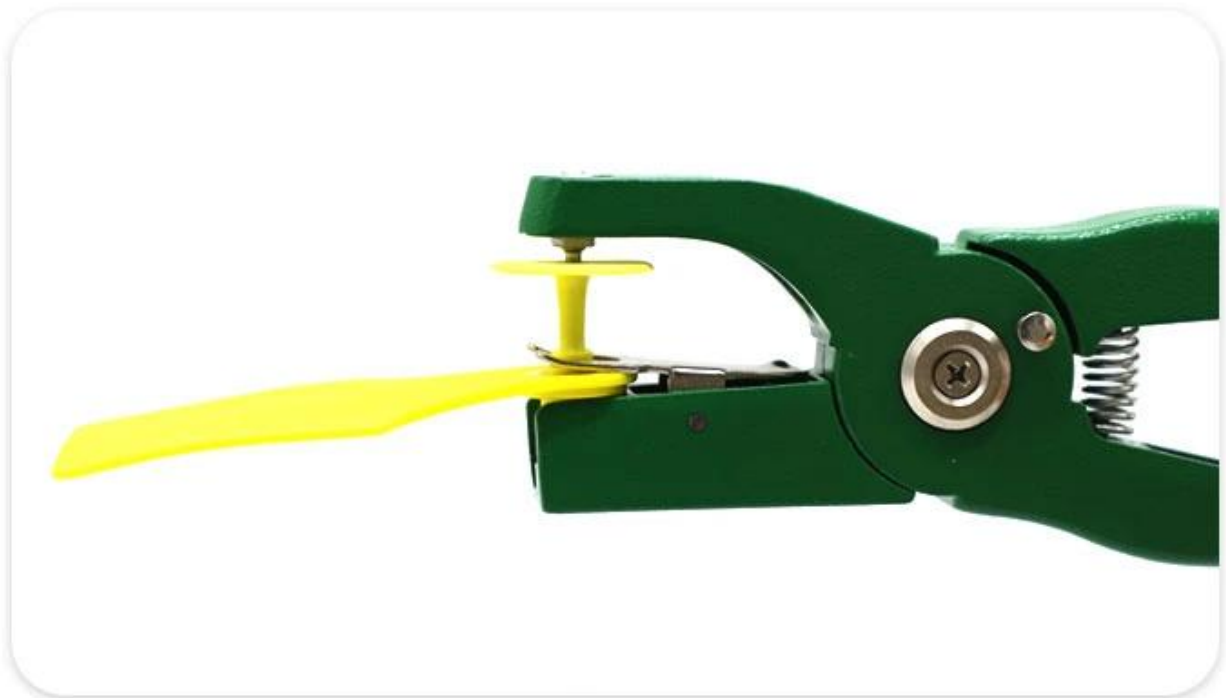
Animal ear tag pliers