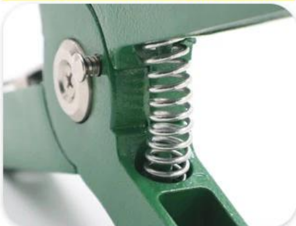
Powerful spring saves time and effort