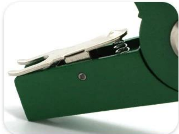
Sturdy stainless steel card label