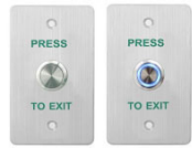
K14F K14FL 115x70mm