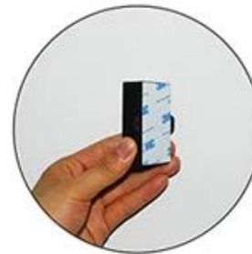
Stick it on the back of the Mini Controller