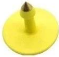
Rfid ear tag