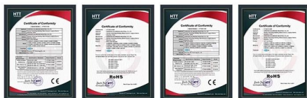
RFID Card Reader CE RFID Card Reader RoHS UHF Reader CE Certificate UHF Reader RoHS