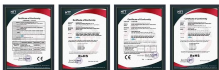
Access Control CE Access Control RoHS EM Lock EMC Certificate EM Lock RoHS Certificate