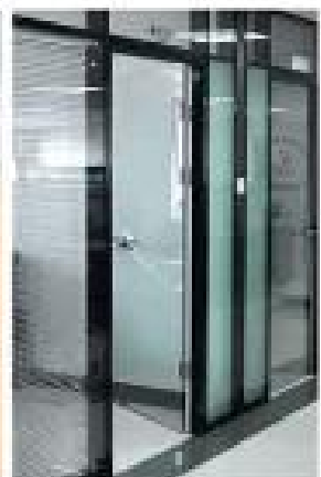
Glass Door with Frame