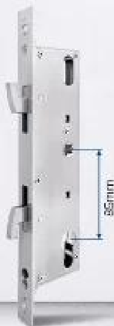
85 Series with double hook