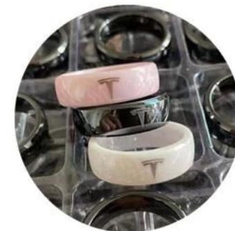
Metal inlaid LOGO