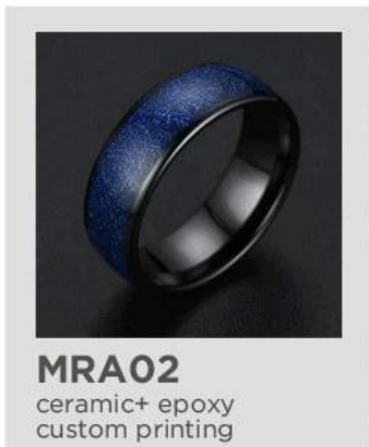
MRA02 ceramic+ epoxy custom printing