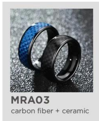
MRA03 carbon fiber + ceramic