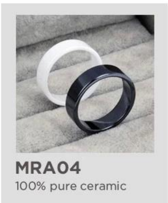
MRA04 100% pure ceramic