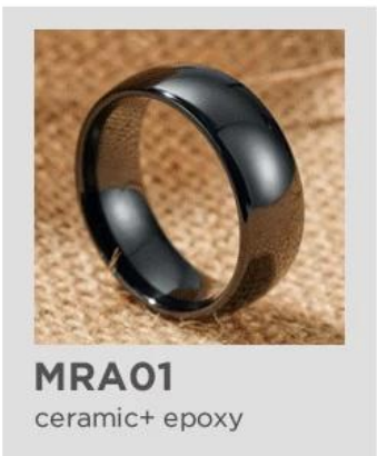
MRA01 ceramic+ epoxy