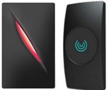
Access Control Reader