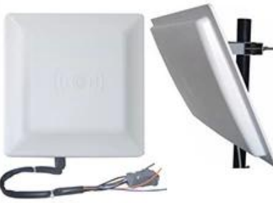
Long Distance UHF Reader