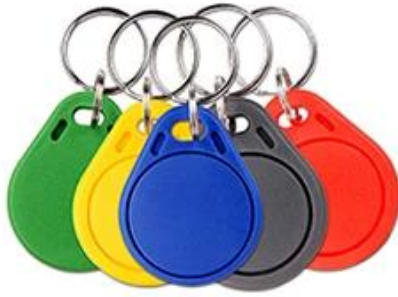
RFID Key fob