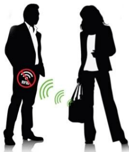
A hacker may carry around a concealed digital reader, scanning your personal info.

Criminals will be able to use scanners to steal your information within 3M.