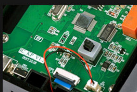
Tamper alarm function