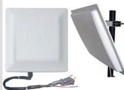
Long Distance UHF Reader