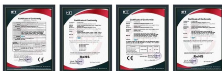
Access Control CE Access Control RoHS EM Lock EMC Certificate EM Lock RoHS Certificate