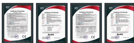
RFID Card Reader CE RFID Card Reader RoHS UHF Reader CE Certificate UHF Reader RoHS