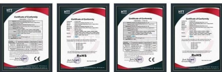
RFID Card Reader CE RFID Card Reader RoHS UHF Reader CE Certificate UHF Reader RoHS