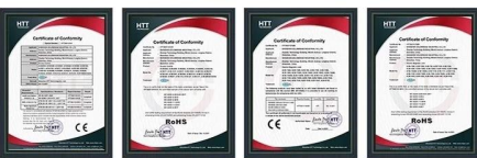
Access Control CE Access Control RoHS EM Lock EMC Certificate EM Lock RoHS Certificate