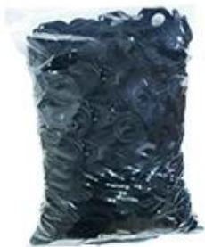
1. Plastic Checkpoint: 500pcs/poly bag