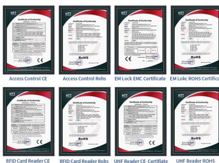
Access Control CE Access Control RoHS EM Lock EMC Certificate EM Lock RoHS Certificate RFID Card Reader CE RFID Card Reader RoHS UHF Reader CE Certificate UHF Reader RoHS