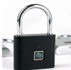
( ACM-Finger610A )

Sample : $ 12.90 100PC : $ 9.75 500PC : $ 8.95