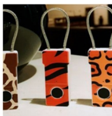
( ACM-Finger710A )

Sample : $ 9.90 100PC : $ 7.85 500PC : $ 7.05