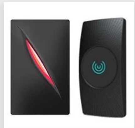
Access Control Reader