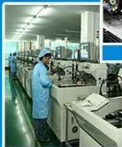
Auto antenna winding