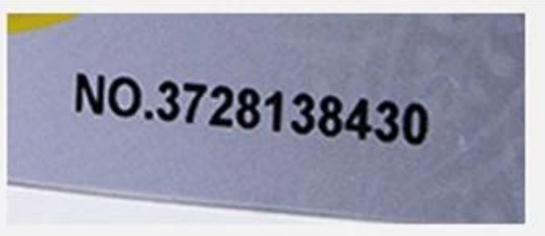
Black flat code