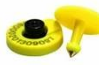
Cattle Animal Ear Tag