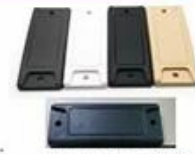
Anti-metal tag 79*30mm