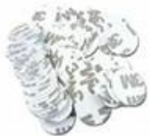
Coin Tag ID/IC 20mm