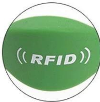
Silk screen printing