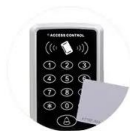
entrance guard card