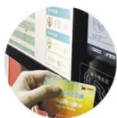
parking access management