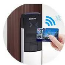
The hotel card