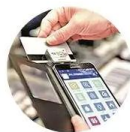
Pay credit card