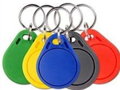
RFID Key fob