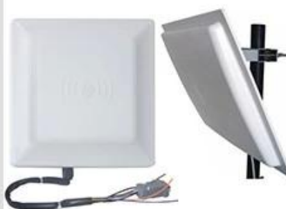
Long Distance UHF Reader