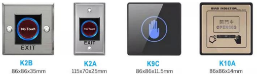
K2B K2A 86x86x35mm 115x70x25mm K9C K10A 86x86x11.5mm 86x86x14mm