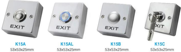
K15A K15AL 53x53x25mm 53x53x25mm K15B K15C 53x53x25mm 53x53x25mm