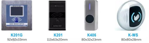
K201G K201 92x92x33mm 113x63x20mm K406 K-WS 80x32x23mm 80x80x28mm