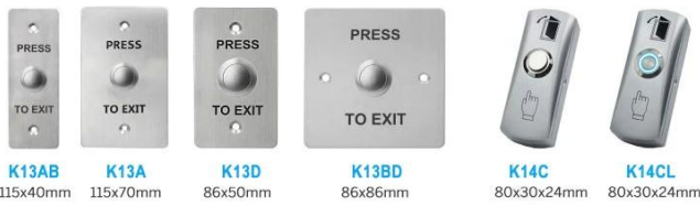
K13AB K13A 115x40mm 115x70mm K13D K13BD 86x50mm 86x86mm K14C K14CL 80x30x24mm 80x30x24mm