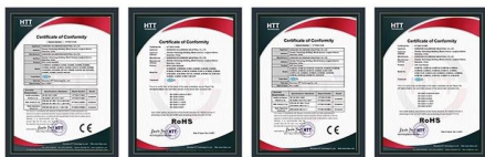
RFID Card Reader CE RFID Card Reader RoHS UHF Reader CE Certificate UHF Reader ROHS