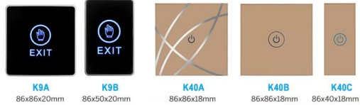
K9A K9B 86x86x20mm 86x50x20mm K40A K40B K40C 86x86x18mm 86x86x18mm 86x40x18mm