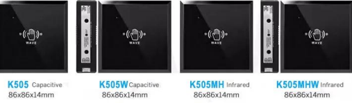
K505 K505W 86x86x14mm 86x86x14mm K505MH K505MHW 86x86x14mm 86x86x14mm