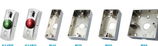
K14BR K14BG 80x30x25mm 80x30x25mm M40 M70 115x40mm 115x70mm M50 M86 86x50mm 86x86mm