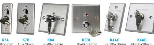
K7A K7B 91x28mm 115x70mm K8A K8BL 86x86x38mm 86x86x38mm K4AC K4AD 86x86x38mm 86x86x38mm