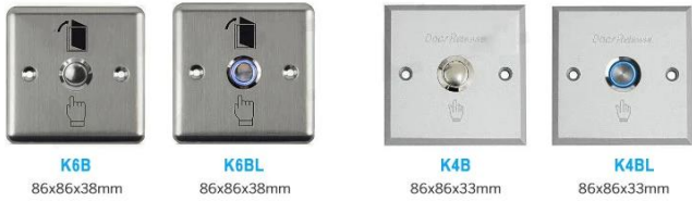
K6B K6BL 86x86x38mm 86x86x38mm K4B K4BL 86x86x33mm 86x86x33mm