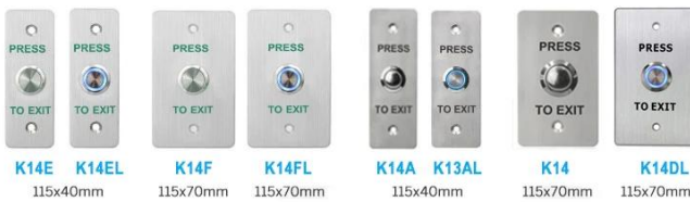
K14E K14EL 115x40mm K14F K14FL 115x70mm 115x70mm K14A K13AL 115x40mm K14 K14DL 115x70mm 115x70mm