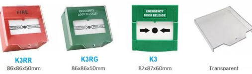
K3RR K3RG K3 Transparent 86x86x50mm 86x86x50mm 87x87x60mm