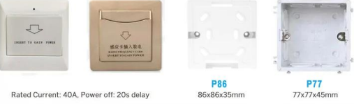
P86 P77 86x86x35mm 77x77x45mm

Rated Current: 40A, Power off: 20s delay