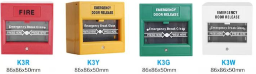
K3R K3Y K3G K3W 86x86x50mm 86x86x50mm 86x86x50mm 86x86x50mm