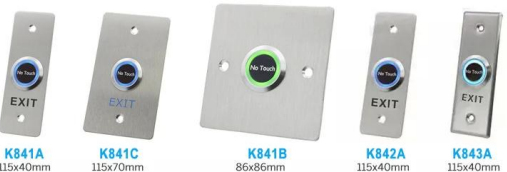
K841A K841C 115x40mm 115x70mm K841B K842A K843A 86x86mm 115x40mm 115x40mm