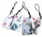
ID/IC Epoxy Tag