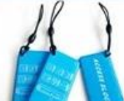
UID Tag 50*30MM