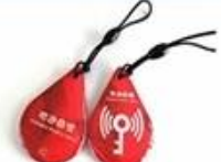
F08 Tag 30*45mm