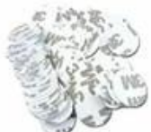
Coin Tag ID/IC 20mm