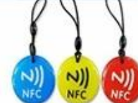
NFC NTAG213 Tag