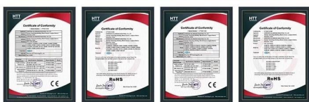
RFID Card Reader CE RFID Card Reader RoHS UHF Reader CE Certificate UHF Reader RoHS