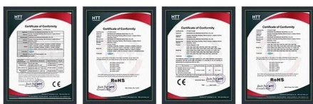
Access Control CE Access Control RoHS EM Lock EMC Certificate EM Lock RoHS Certificate