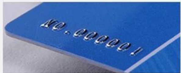
Silver Convex code