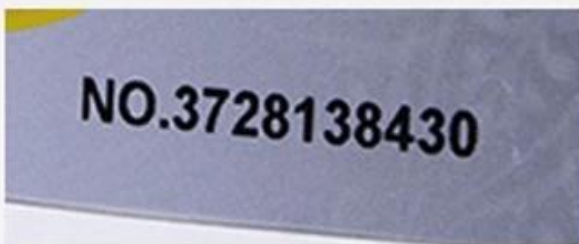
Black flat code