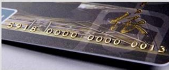
Gold Convex code