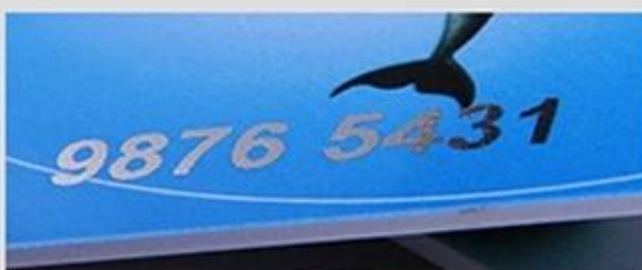
Silver flat code