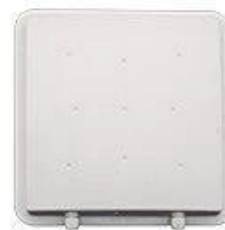
ACM-811A-8dBi Muti-tag Reader, 6-9 meters, 255x255x45MM