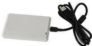
ACM217-UHF UHF Reader and Writer - Provide Free program and SDK