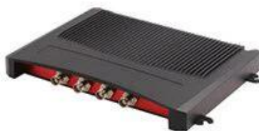
ACM919L 4 Ports UHF Reader Impinj R2000 ,270mm*180mm*27mm