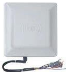
ACM-812A -8dBi 2-6 meter , 235x235x57mm