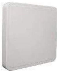
ACM-803A -9dbi 6-10 meters,260X260X45mm