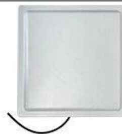
ACM-819A-12dBi Muti-tag Reader, 10-20 meters, 460x460x55MM