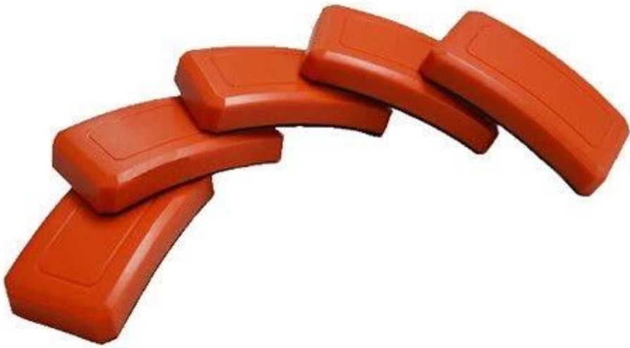
anti metal rfid tags for gas cylinder