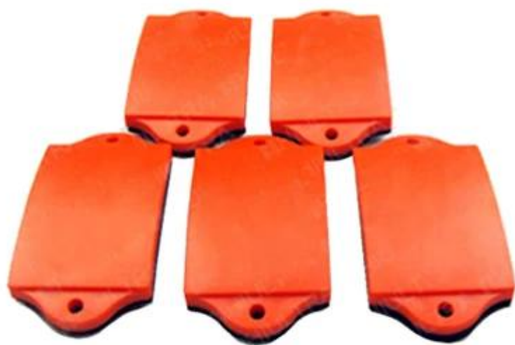
anti metal rfid tags for gas cylinder