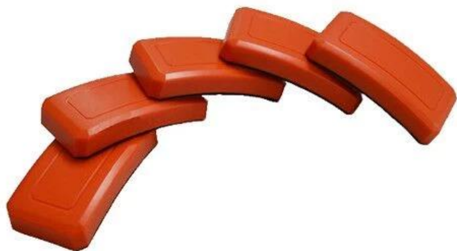
anti metal rfid tags for gas cylinder