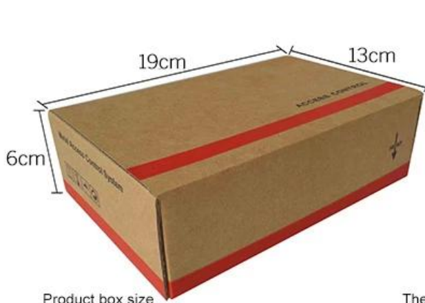
Product box size