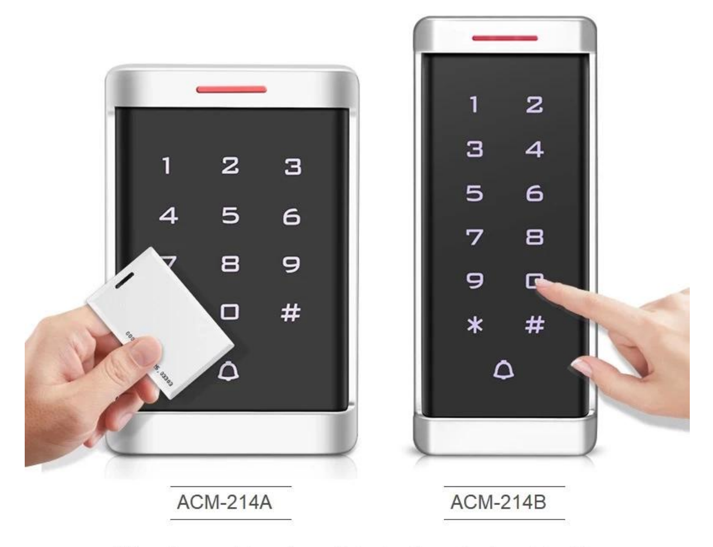
* Zinc alloy made housing, polished surface, sturdy and durable