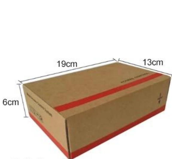
Product box size