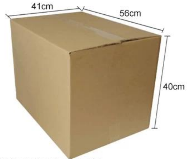
The product packing size