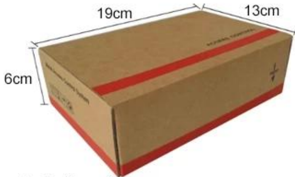
Product box size