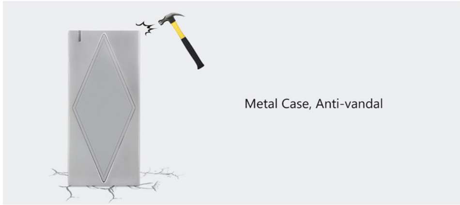
Metal Case, Anti-vandal