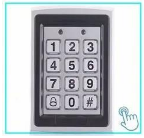
ACM210-W RFID metal single door access control (not waterproof)

RFID waterproof single door reader and access control