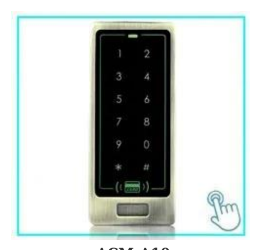
ACM-A10 New rfid access control standalone metal touchscreen keypad