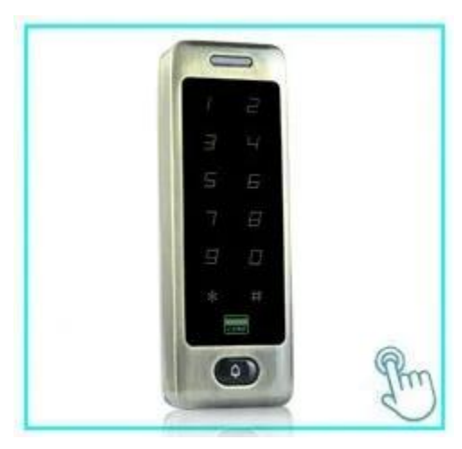
ACM-A40 EM RFID card + PIN code for single