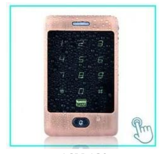
ACM-A30 New rfid access control standalone metal touchscreen keypad Silver / Red bronze / Green bronze / White bronze / Gold

Touch keypad RFID access control, 125Khz EM, Can connect the wiegand reader