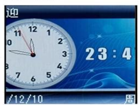
2.8 inch TFT color screen

Thick billiton electricity marketing solutions, provide enterprises with correspondence enterprise actual situation, and conform to the holistic solution of electronic commerce development in traditional channels complementary, expand internet sales channels, increase sales and market share