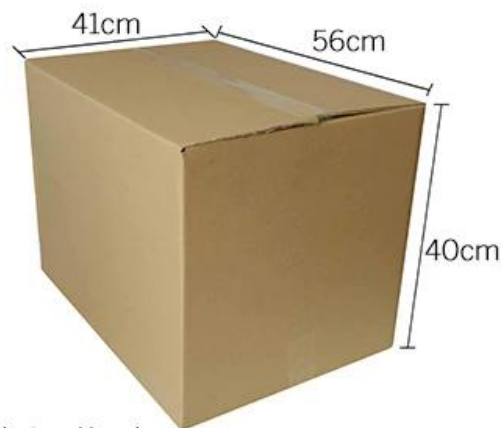
The product packing size