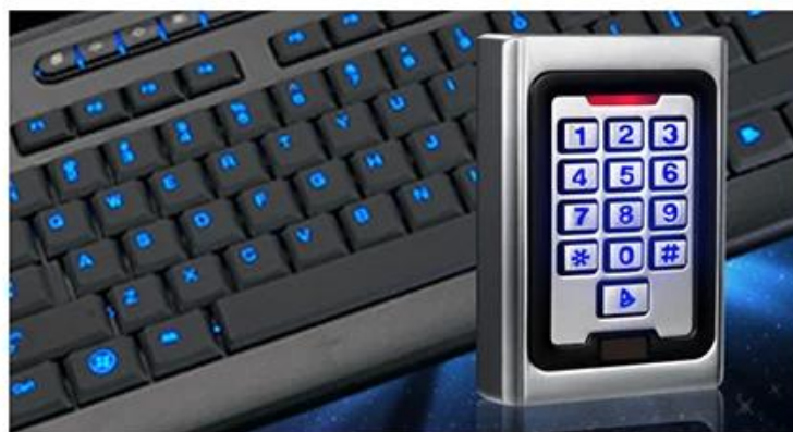
Digital Backlit Keypad