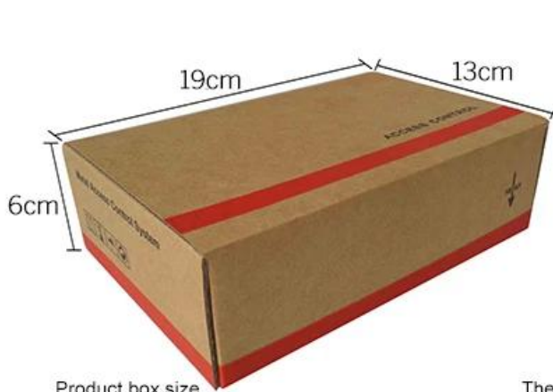
Product box size