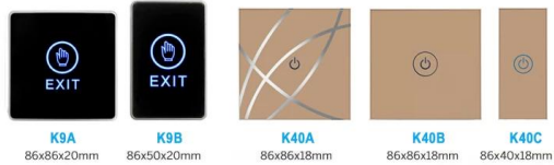
K9A K9B 86x86x20mm 86x50x20mm K40A K40B K40C 86x86x18mm 86x86x18mm 86x40x18mm