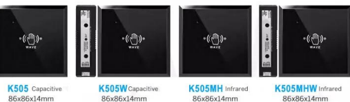
K505 K505W 86x86x14mm 86x86x14mm K505MH K505MHW 86x86x14mm 86x86x14mm