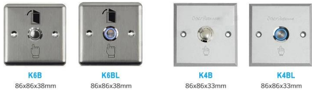
K6B K6BL 86x86x38mm K4B K4BL 86x86x33mm