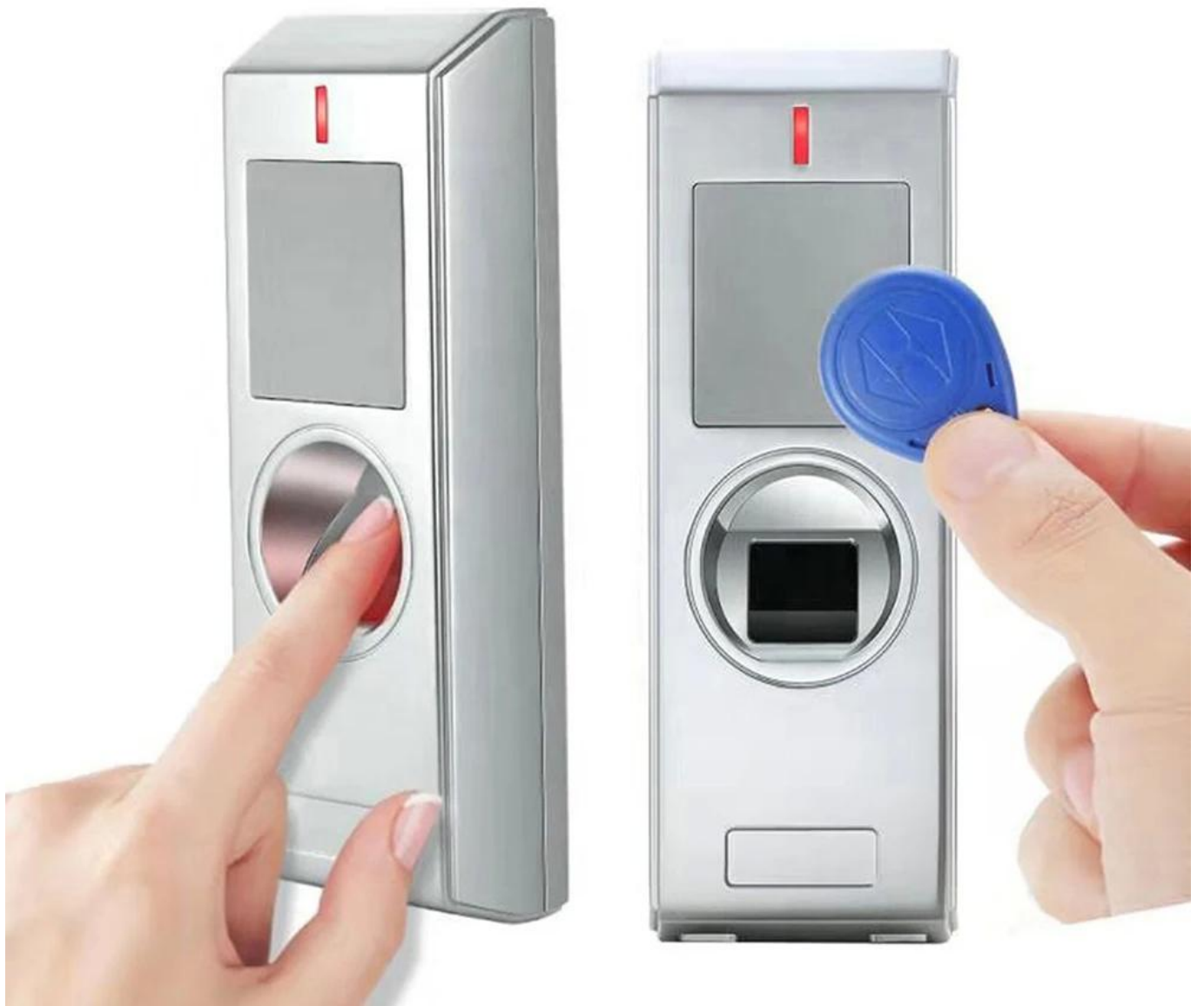
Access Control System