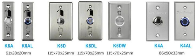
K6A K6AL 91x28x20mm K6D K6DL K6DW 115x70x25mm 115x70x25mm 115x70x25mm K4A K4AL 86x50x33mm