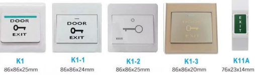
K1 K1-1 K1-2 K1-3 K11A 86x86x25mm 86x86x24mm 86x86x25mm 86x86x20mm 76x23x14mm