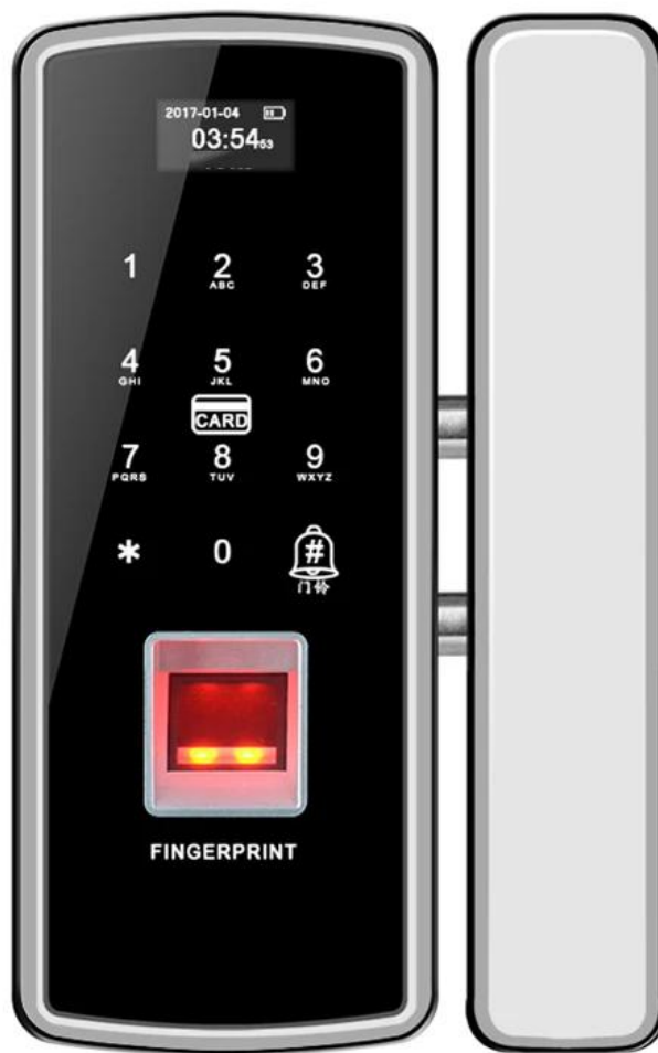
Home Office Smart Lock System