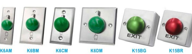
K6AM K6BM 115x40mm 115x70mm K6CM K6DM 86x50mm 86x86mm K15BG K15BR 53x53x25mm 53x53x25mm