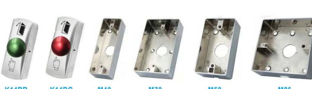
K14BR K14BG 80x30x25mm 80x30x25mm M40 M70 115x40mm 115x70mm M50 M86 86x50mm 86x86mm