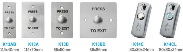
K13AB K13A 115x40mm 115x70mm K13D K13BD 86x50mm 86x86mm K14C K14CL 80x30x24mm 80x30x24mm