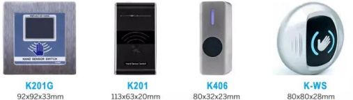
K201G K201 92x92x33mm 113x63x20mm K406 K-WS 80x32x23mm 80x80x28mm