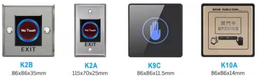
K2B K2A 86x86x35mm 115x70x25mm K9C K10A 86x86x11.5mm 86x86x14mm