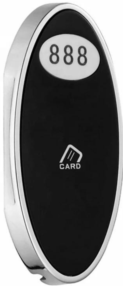
Locker Lock System