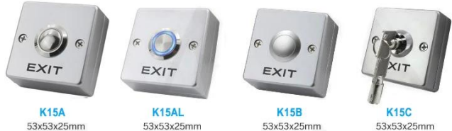
K15A K15AL 53x53x25mm 53x53x25mm K15B K15C 53x53x25mm 53x53x25mm