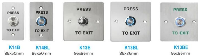
K14B K14BL 86x50mm 86x50mm K13B K13BL 86x86mm 86x86mm K13BE 86x86mm