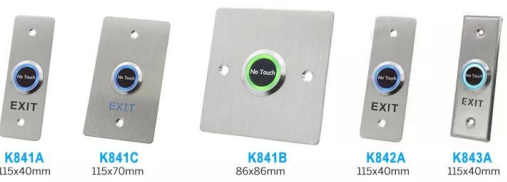
K841A K841C 115x40mm 115x70mm K841B K842A K843A 86x86mm 115x40mm 115x40mm