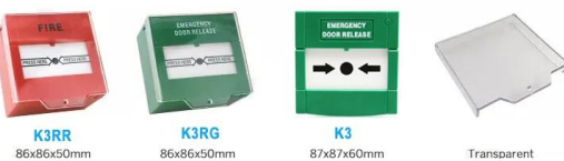
K3RR K3RG K3 Transparent 86x86x50mm 86x86x50mm 87x87x60mm