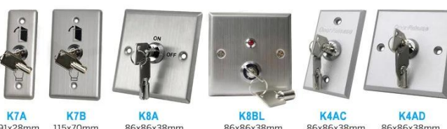
K7A K7B 91x28mm 115x70mm K8A K8BL 86x86x38mm 86x86x38mm K4AC K4AD 86x86x38mm 86x86x38mm