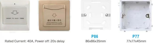
P86 P77 86x86x35mm 77x77x45mm Rated Current: 40A, Power off: 20s delay