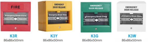
K3R K3Y K3G K3W 86x86x50mm 86x86x50mm 86x86x50mm 86x86x50mm