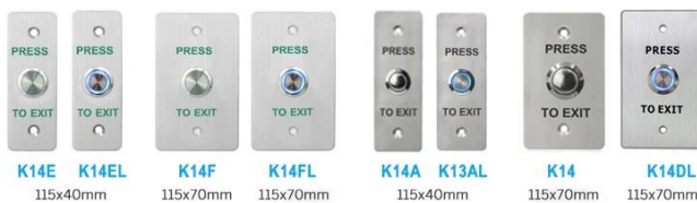
K14E K14EL 115x40mm K14F K14FL 115x70mm 115x70mm K14A K13AL 115x40mm K14 K14DL 115x70mm 115x70mm