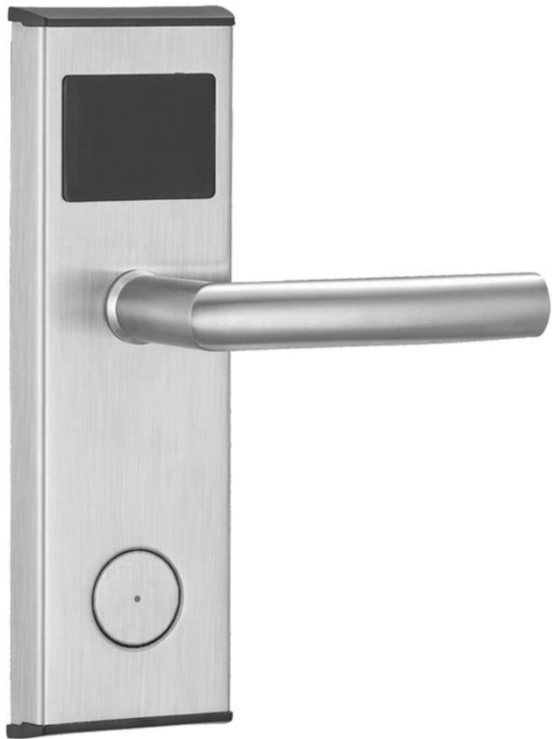
Hotel Door Lock System