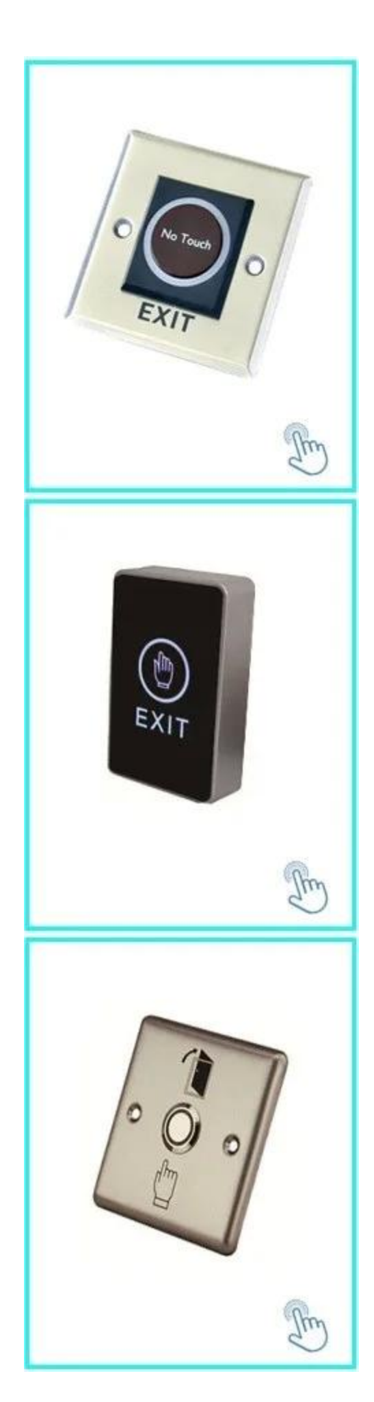
No touch Door Realese Exit Button