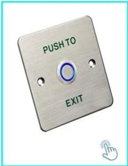
Door release button, (steel,