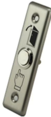
Silver Push Button Switch