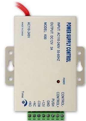
Access Power Supply