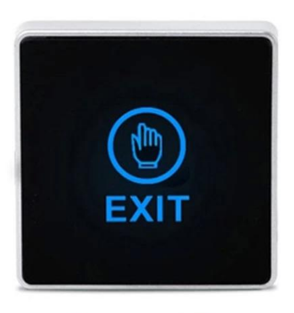
Power on status