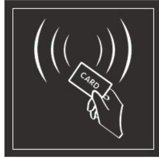
ID EM Cards