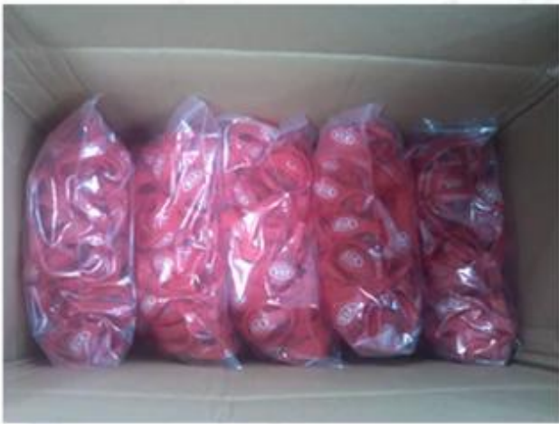
Package for Silicone Wristbands

High Quality RFID Silicon Wristbands for Events Waterproof RFID Wristbands bracelet nfc Ntag213/215/216 silicon rfid wristband