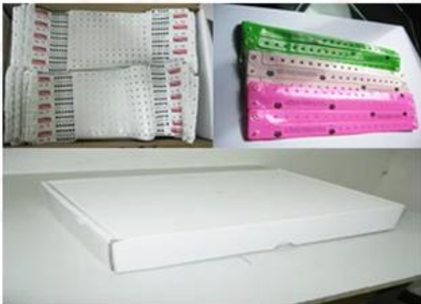
Package for Soft PVC/ Paper Wristbands