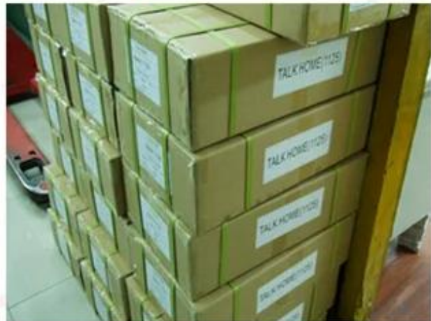
Outside Carton Package