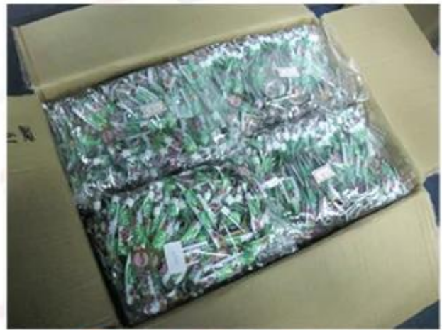
Package for Woven Wristbands