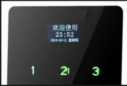
OLED LCD screen