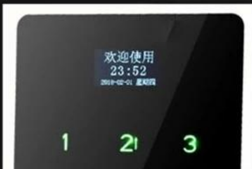
OLED LCD screen