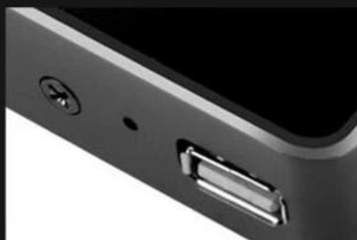
U disk transfer information