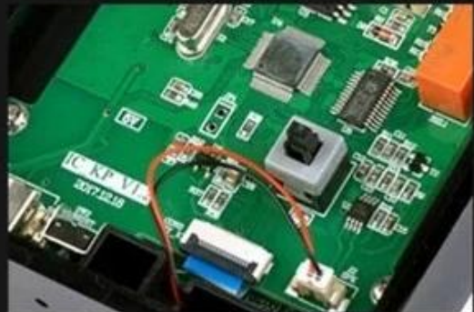
Tamper alarm function