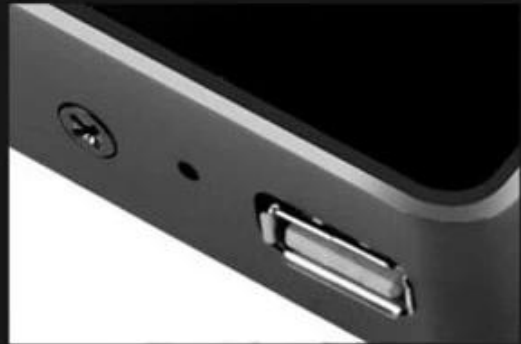
U disk transfer information.