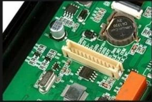
Import ARM32-bit CPU system