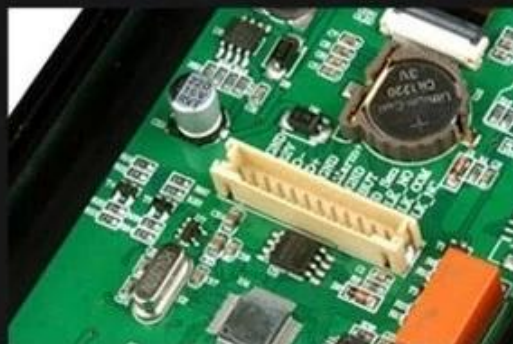
Import ARM32-bit CPU system