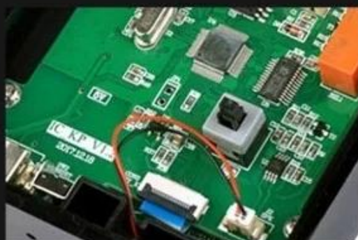
Tamper alarm function