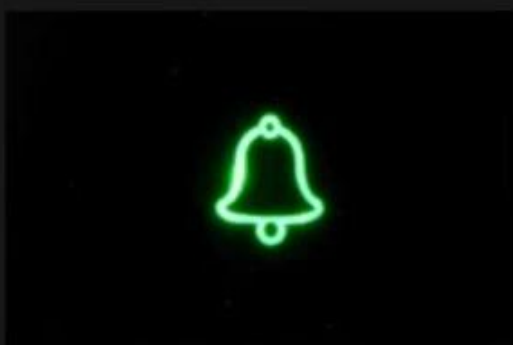
Backlit doorbell button