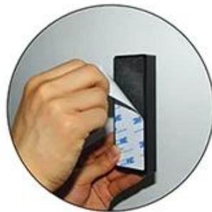
Rip the other side of the sticker