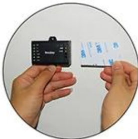
3M Sticker for Mini Controller