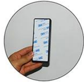
Stick it on the back of the keypad