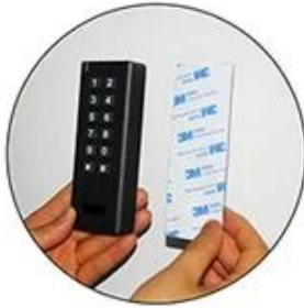
3M sticker for Wireless Keypad