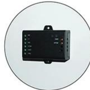
Stick the Mini Controller on the door