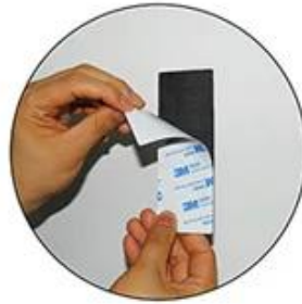
Rip one side of the sticker