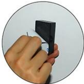
Rip the other side of the sticker