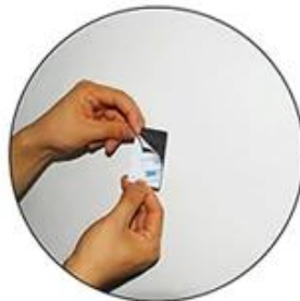
Rip one side of the sticker