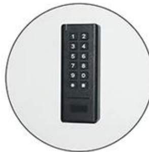
Stick the keypad on the door