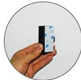
Stick it on the back of the Mini Controller