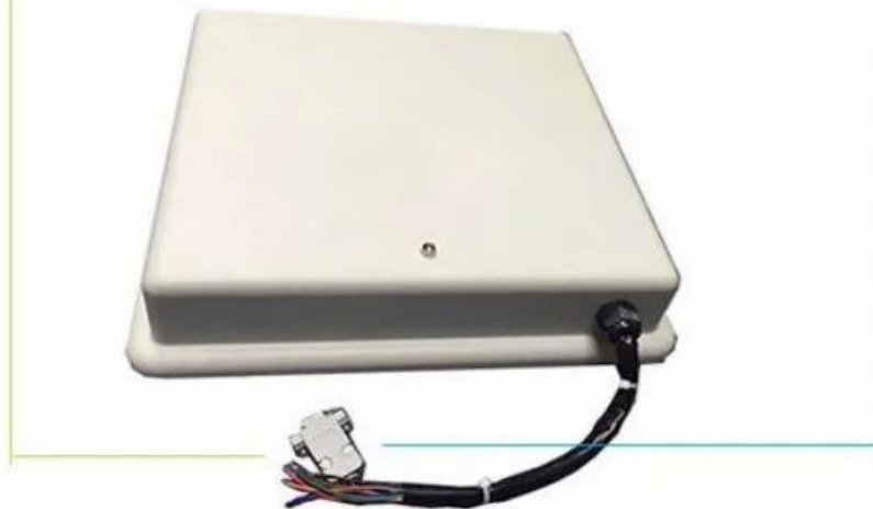
Wiring Diagram of RFID UHF reader and writer